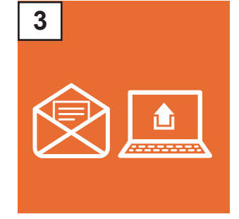
Register and Submit Application Online or via Mail