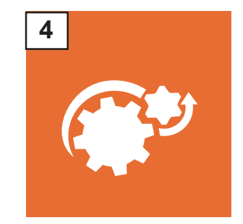
It May Take 2 to 10 Months to Hear Back