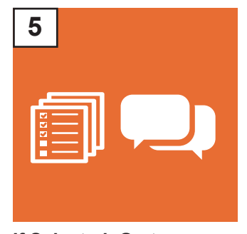
If Selected, Go to Your Appointment with Documents

Sign a lease, appeal, or apply to others