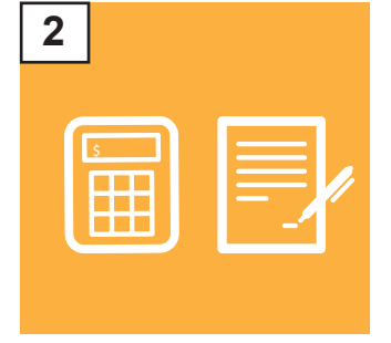
Learn About Eligbility and Application Requirements